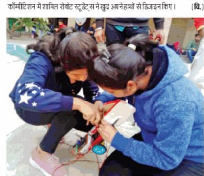
टेविनक ल प्रॉब्लम को स्ट डेंट स ने ही खुद दूर किया।