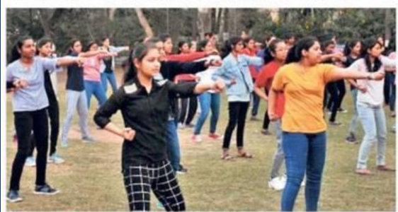
शिविर में आत्मरक्षा का प्रशिक्षण लेतीं छात्राएं।

सिटी रिपोर्टर | एमआईटीएस में छात्राओं के लिए आत्मरक्षा प्रशिक्षण शिविर की शुरुआत की गई है। मंगलवार को इसमें छात्राओं ने आत्मरक्षा के लिए विभिन्न तरीके जाने। एक्सपर्ट ने कहा कि आपके पर्स में रखा नेल कटर और पेन का उपयोग भी आप आत्मरक्षा के लिए कर सकती हैं। साथ ही पर्स में मिर्ची स्प्रे रखना चाहिए। अंत में छात्राओं की जिज्ञासाओं का समाधान किया गया। इसी क्रम में बुधवार को भी विभिन्न टेक्निक छात्राओं को सिखाई जाएंगी।