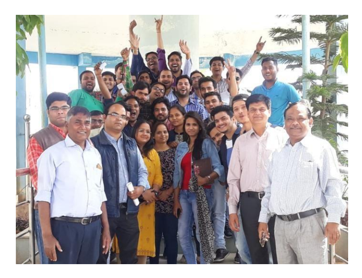
World Water Day was celebrated on 26 March 2019 in collaboration with IWWA Gwalior Centre.

One Day Technical/ Industrial visit of B.E. Final Year Students, M.E. CTM First Year Students & M.Tech Environmental Engg. First Year Students was organized on 15 March 2019 to Water Treatment Plant at Tighra Dam, Gwalior Distillery & Pipe Factory at Banmore.