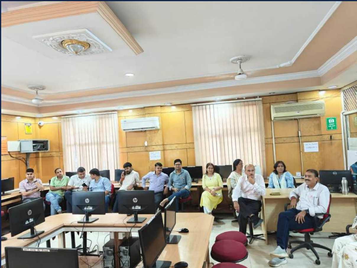
Engineer's Day Celebration