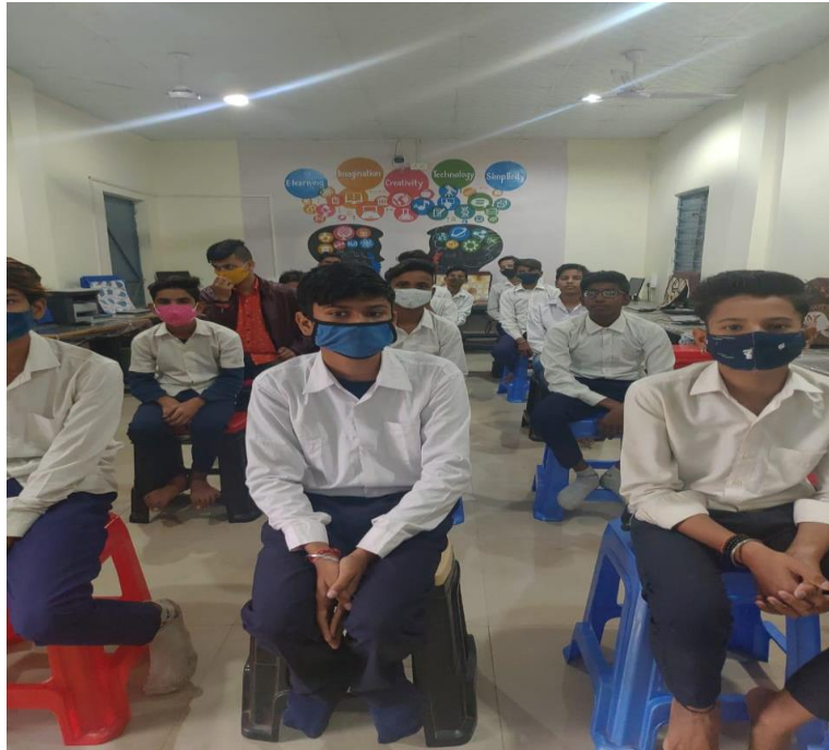
Students of Govt. Higher Secondary School, DRP Line, Gwalior attending the online session