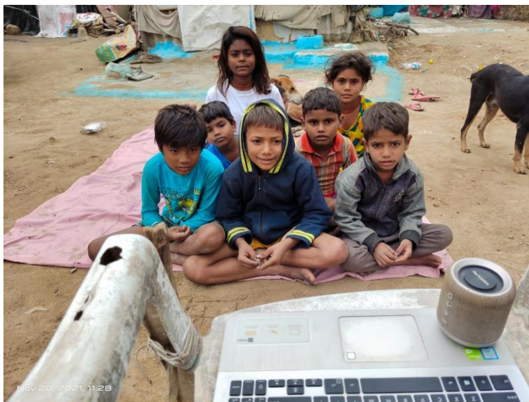
Children of Slum watching the online session