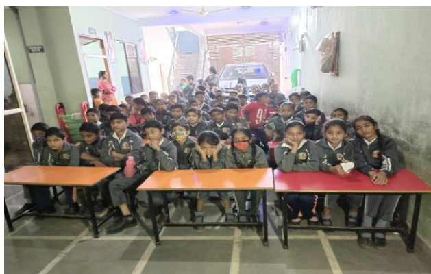
Students of Kids World School, Gwalior watching the online session